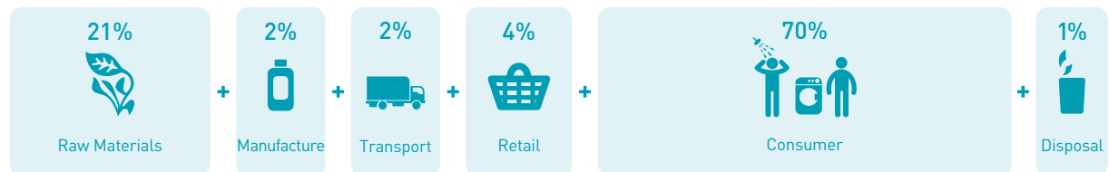
Unilever's Greenhouse Gas Footprint

Finally, when it comes to the environment, we work across the whole value chain – from the sourcing of raw materials to our factories and the way consumers use our products.